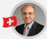
Tarek Shaarawy, Switzerland